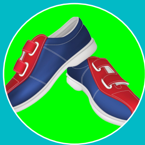
3 Pairs of Shoes