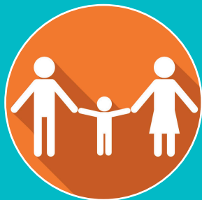
Average family of 3

How quickly does the pass pay for itself based on a average visit from a average sized family?