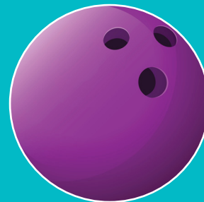
1 Hour of Bowling